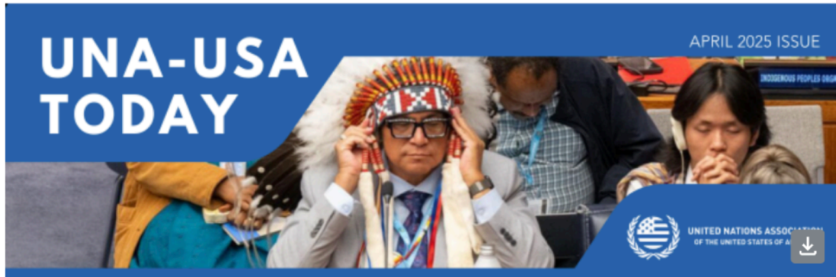
First Plenary of 24th Session of Permanent Forum on Indigenous Issues