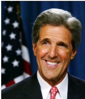
Senator John Kerry

Senator asserted the importance of a more knowledgeable and active constituent base in the US to help overcome the politics of Congress which he said have been impeding international cooperation.