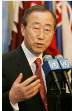
Secretary General-Ban-Ki Moon

cal risks of climate change, alleviate hunger, illness and poverty. He emphasized that the United States cannot shoulder such global challenges without cooperation, international agreements, joint financing, and a more effective United Nations.