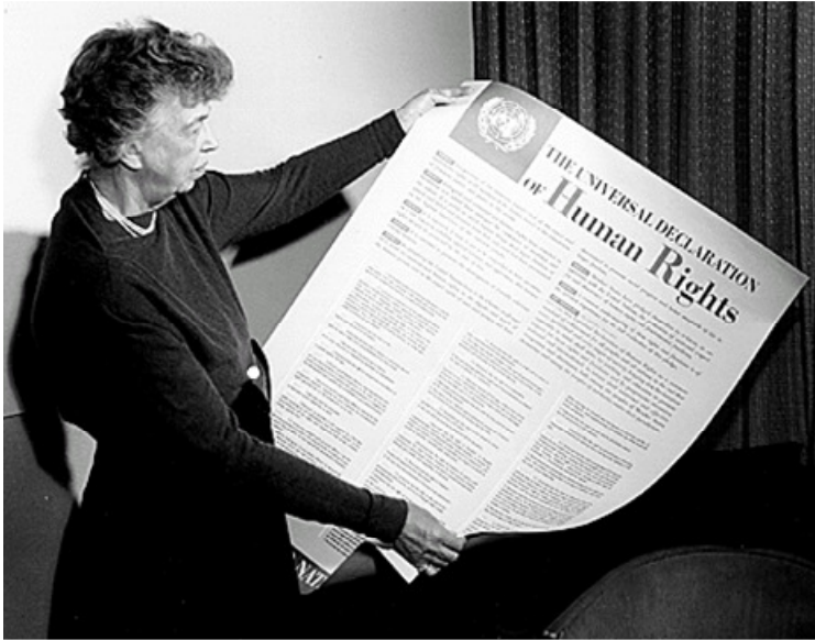
Eleanor Roosevelt reads UDHR articles